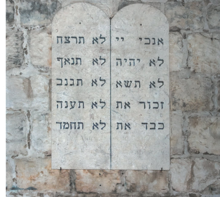
Tablets with the ten commandments on the wall near the grave of King David in the old city of Jerusalem, Israel

It is possible to read today's Gospel with a slight criticism in our minds. Which is the most important law or rule or commandment?